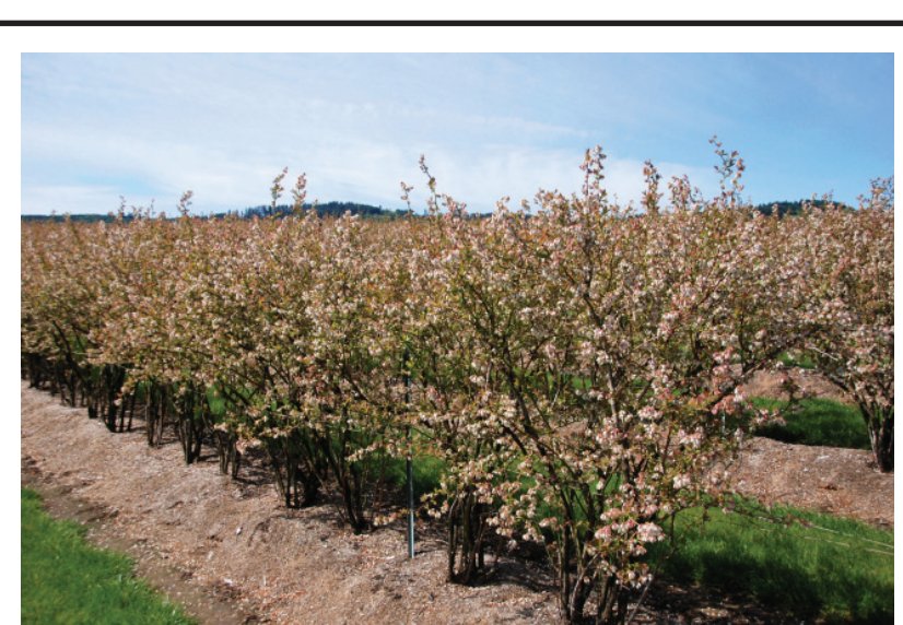
ARS researchers in Corvallis, Oregon, are developing and improving blueberries for the Pacific Northwest. Shown here are Elliott blueberry plants in full bloom.

Splitting can be mild, in the form of a shallow crack in the skin, to severe, such as deep wounds that penetrate the pulp. But regardless of severity, all splitting renders the fruit unmarketable. Growers in Mississippi and Louisiana have reported as much as 20 percent crop loss on highly susceptible cultivars. That amounts to losses of $300 to $500