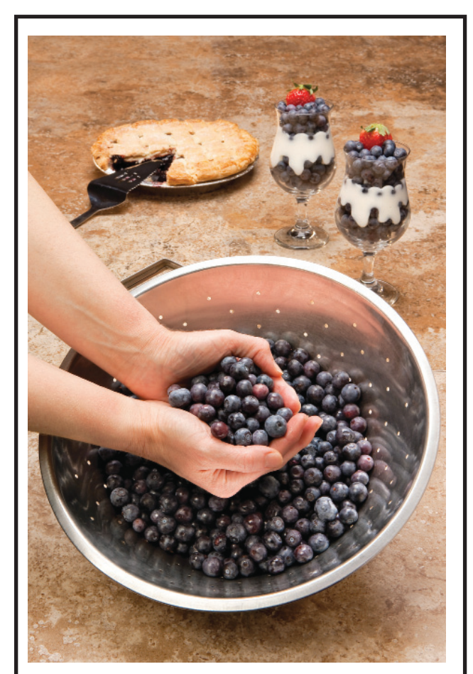
Blueberries are popular and versatile—you can put them in or on almost anything. But the berry would not be where it is today without the efforts ARS researchers. Today, ARS scientists are busy solving growers' problems with blueberry disease, firmness, splitting, and cold tolerance.

Formerly with Agriculture Research Service, USDA