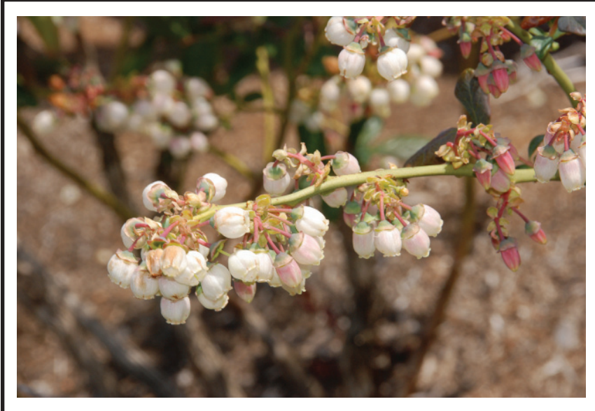
Close-up of blueberry flowers.