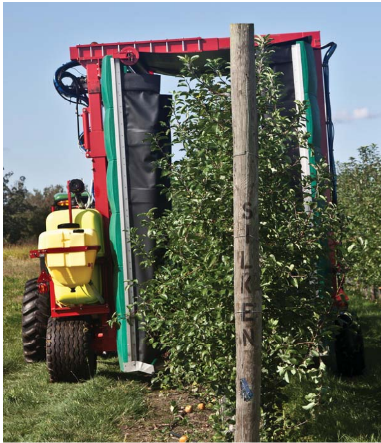
Figure 5. The Tunnel Sprayer directs material into the canopy from the outside and captures that which passes through the canopy.

Hands-on demonstrations were conducted at twilight meetings on May 17, 2011, and April 17, 2012, at the UMass Cold Spring Orchard Research & Education Center (35 and 30 farmers in attendance in 2011 and 2012, respectively), and presentations (with video) were given at three additional twilight meetings (May 18, 19, and 26, 2011) with total attendance of 129 farmers. It also was demonstrated at the 2012 Annual Summer Meeting of the Massachusetts Fruit Growers' Association at the UMass Cold Spring Orchard Research & Education Center on July 16, 2012, with approximately 100 farmers in attendance. Small-scale demonstrations were conducted several times during the two years to a total of approximately 200 individuals.