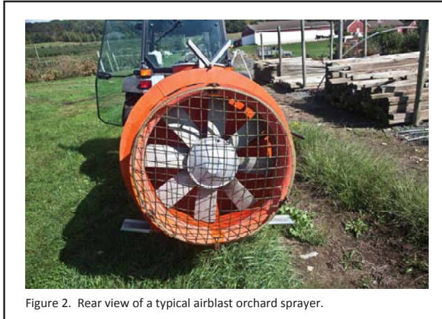
Figure 2. Rear view of a typical airblast orchard sprayer.