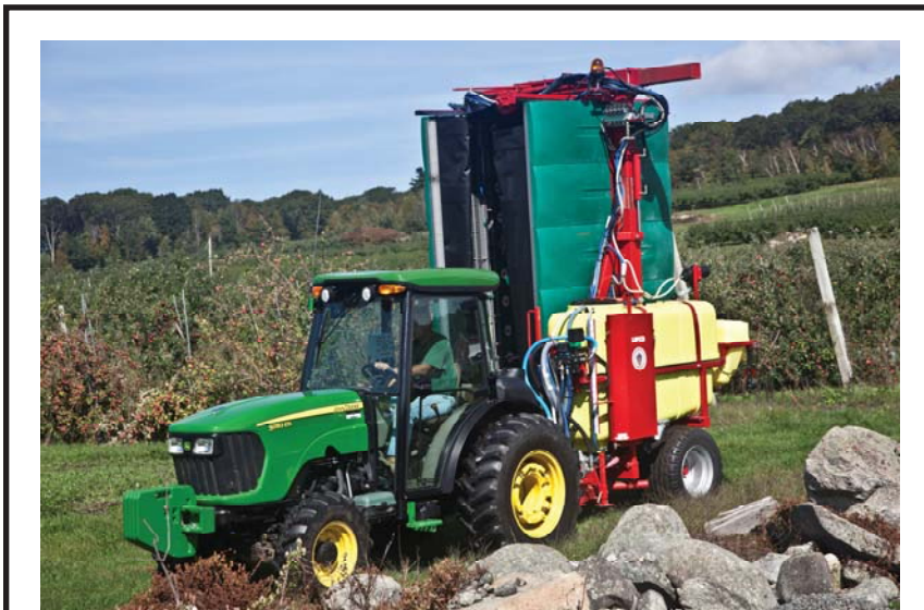
Figure 1. Lipco Tunnel Sprayer at the UMass Cold Spring Orchard Research & Education Center.

Using published charts relative to the fluid flow out of the sprayer nozzles, we adjusted the tunnel sprayer and an airblast