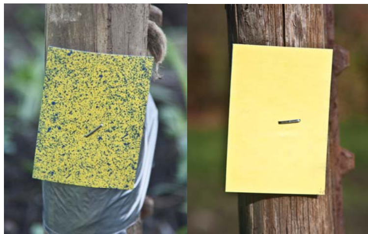
Figure 6. Water sensitive paper showing drift from the airblast sprayer (left photo) and the lack of any spray drift from the tunnel sprayer (right photo).

Educational programs began in earnest in 2011. Details of this project have been recorded in a blog: http://masscon.blogspot.com (Massachusetts Containment Spraying Blog). Four video presentations are provided in the blog to describe progress during the early stages of the process. The blog has been visited a total of 1,579 times since its creation 16 months ago. The videos were also provided on YouTube ( http://www.youtube.com/user/wrautio1 ) and, in total, have been viewed 3,142 times.