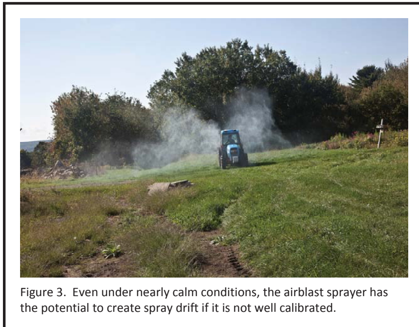
Figure 3. Even under nearly calm conditions, the airblast sprayer has the potential to create spray drift if it is not well calibrated.

sprayer to deliver the same amount of material per acre. Observation suggested that the airblast sprayer resulted in much more drift, but coverage appeared better than with the tunnel sprayer. This observation puzzled us, so we measured flow out of all of the nozzles and found that the published flow rates were wrong. To obtain the desired flow, we purchased new nozzles, and selected air-induction nozzles (to increase particle size and reduce drift potential). With the new nozzles, the tunnel sprayer provided excellent coverage, with far less drift than the airblast sprayer.