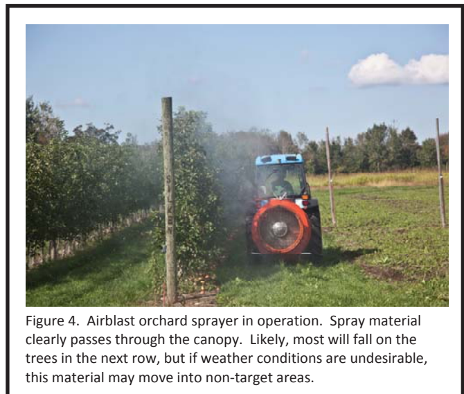
Figure 4. Airblast orchard sprayer in operation. Spray material clearly passes through the canopy. Likely, most will fall on the trees in the next row, but if weather conditions are undesirable, this material may move into non-target areas.

applied with the tunnel sprayer or with the conventional airblast sprayer. Treatments were applied three times throughout the summer. Leaf samples and fruit samples were collected at the end of August. Leaf samples were submitted to the UMass Soil & Tissue Analysis Laboratory for the assessment of nutrient element concentrations. The fruit samples were submitted to the Fruit Program's Fruit Analysis Laboratory for the assessment of calcium concentrations. Unfortunately, fruit tissue results were not yet available at this writing. Leaf analyses, however, showed no significant differences between the types of sprayers, and