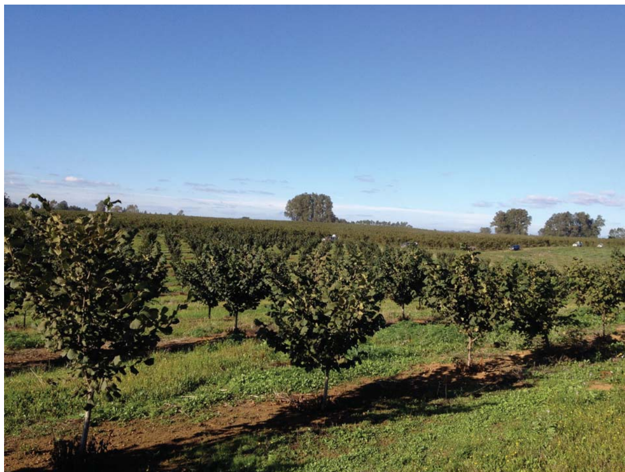
A young hazelnut orchard in Chile.

Hazelnuts are small to large deciduous shrubs native to temperate regions of Europe, North America, and Asia. The European species, Corylus avellana , has the largest nuts and is grown commercially in production orchards in Oregon, where it is pruned to grow as a single-trunk-tree. Hazelnuts have catkins and small female flowers that are wind pollinated. The trees bloom in the late