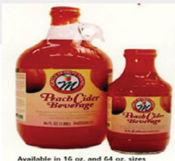
Available in 16 oz. and 64 oz. sizes

Made from fresh New Jersey Peaches "Peach Cider Drink, Peach Salsa, Peach Preserves"