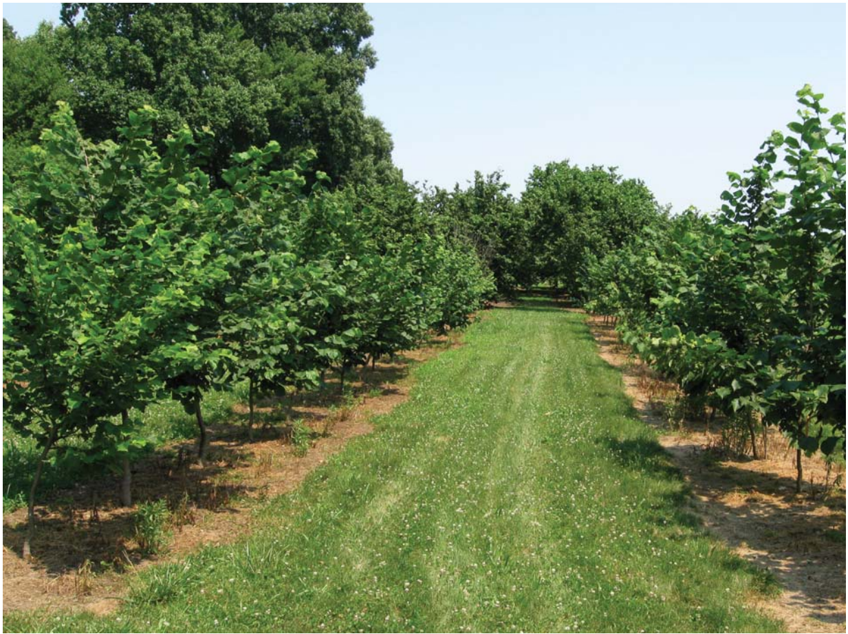
Hazelnut orchard of Rutgers seedlings in New Jersey.

market for hazelnuts as a high-value oil crop.