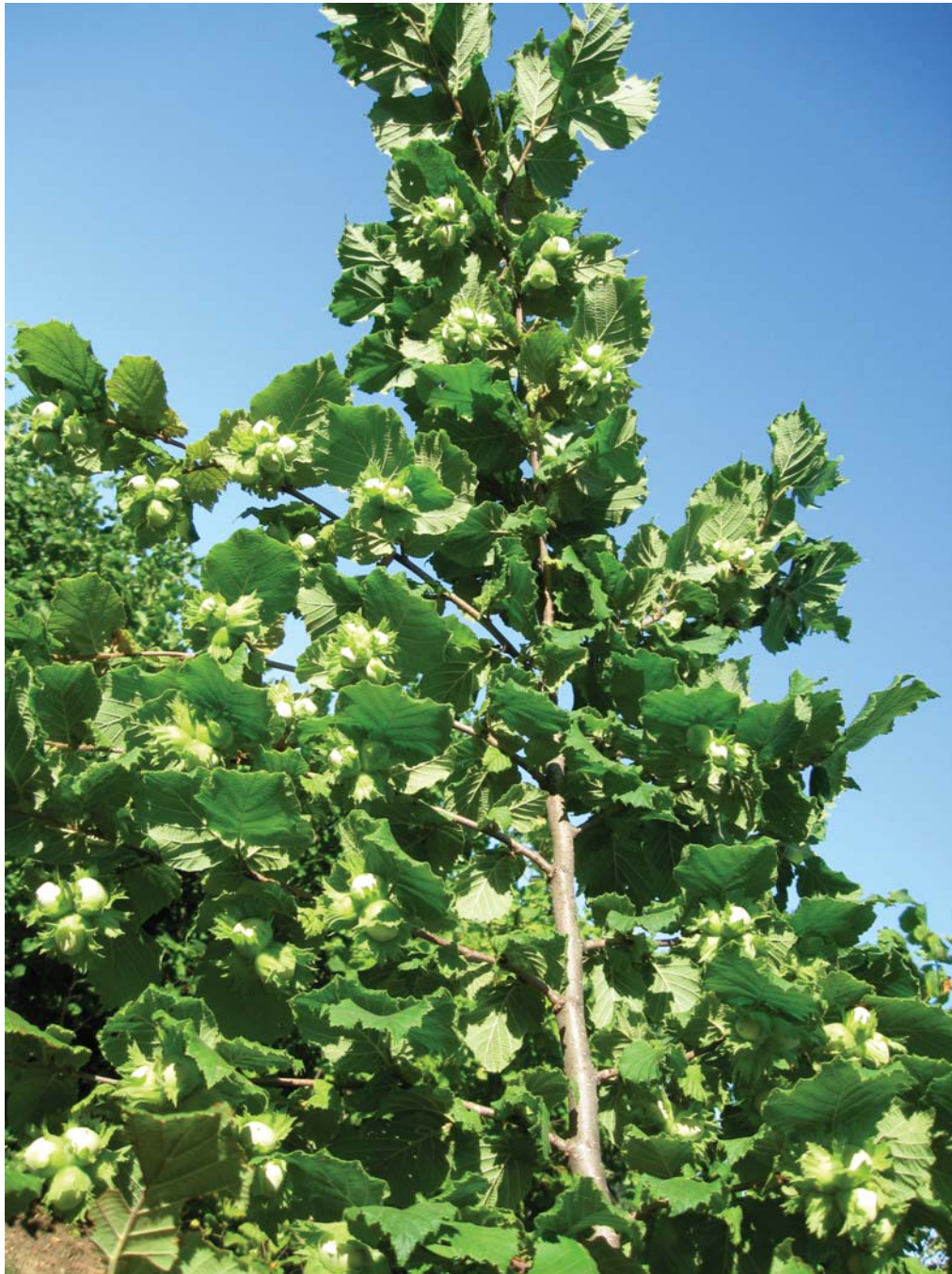
Developing hazelnuts in a New Jersey planting.

winter or early spring before the leaves begin to show. Hazelnuts are self-incompatible and cross incompatible between certain cultivars. Similar to apples, pollinator trees are required in hazelnut orchards. They must be chosen carefully to ensure compatibility with commercially desirable hazelnut species. Hazelnuts