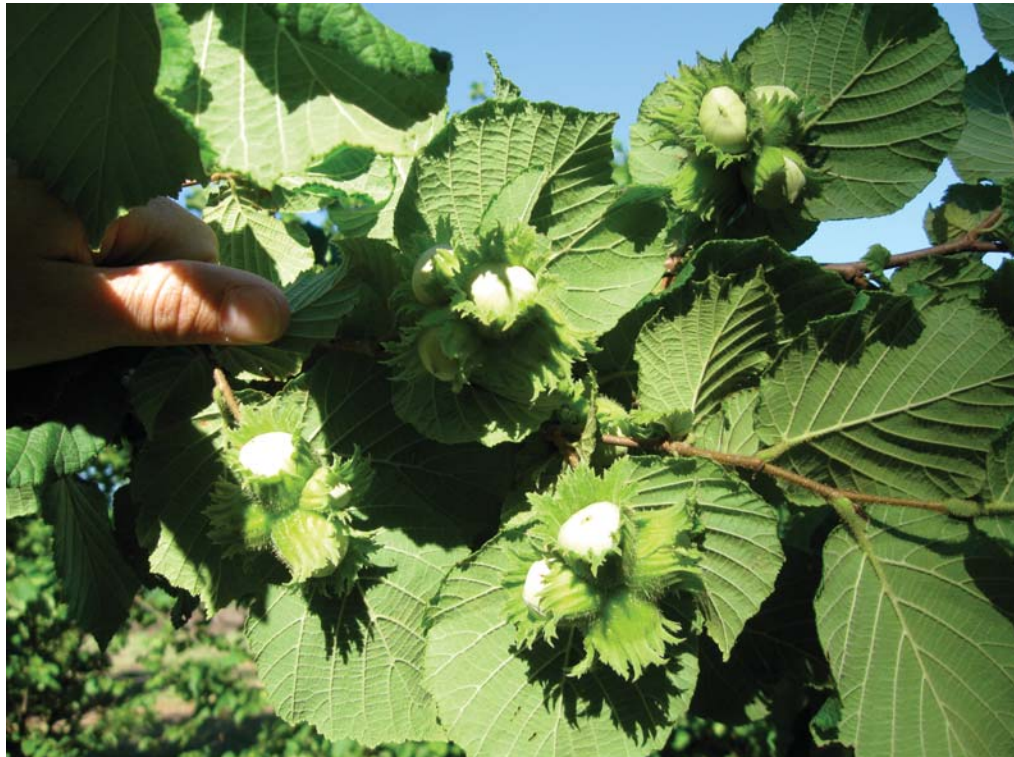
Developing hazelnut fruit.

oil. When coupled with the current breeding efforts, this focus on oil production could lead to an alternate