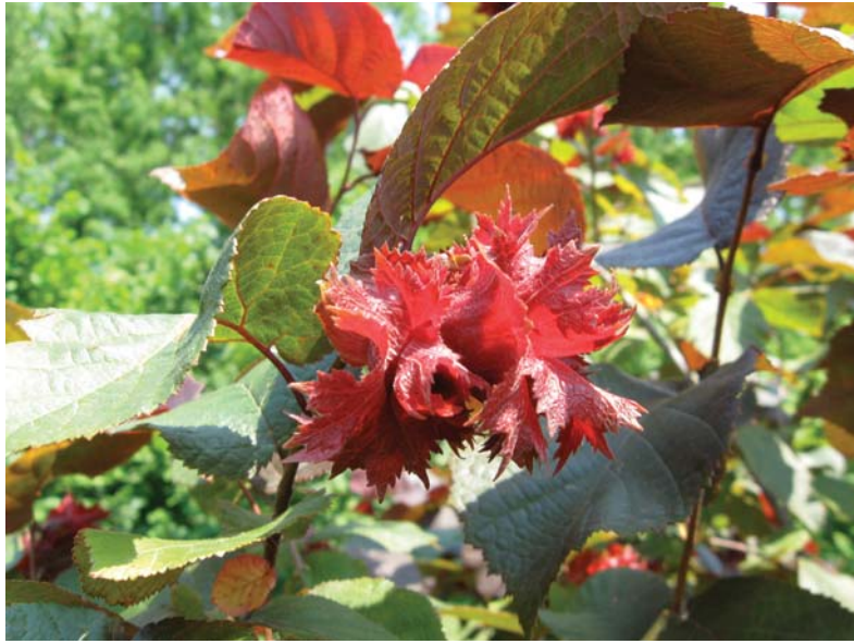
Developing fruits are surrounded by green or red bracts.

University, under the direction of Shawn Mehlenbacher, and Rutgers University, under the direction of Thomas Molnar. The focus of the work at Rutgers has been to develop hazelnuts with better cold tolerance and resistance to EFB, while maintaining the characteristics that are in demand by the hazelnut markets. These characteristics include medium to large nuts with a high kernel percentage, round kernels that blanch well, and excellent flavor. A significant portion of the breeding plan consists of crossing disease resistant American hazelnuts with commercially desirable European cultivars. More recently, work has been done to investigate the oil content of hazelnut kernels, which has been found to consist of 60-75%