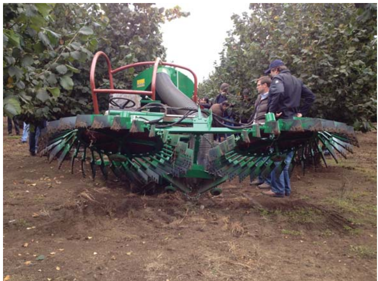
Nut harvester in operation in Chile.

Over the past 40 years, great strides have been made in breeding disease resistance into commercially valuable hazelnut plants. In the 1970s, a gene for resistance to EFB was discovered in a hazelnut named ‘Gasaway’. This gene was used in systematic breeding, which led to the development and recent release of several productive, disease-resistant cultivars. These include Jefferson and Yamhill, along with pollinators Theta, Eta, Gamma, and Epsilon. The ‘Gasaway’ gene has been shown to be insufficient under the intense disease pressure in New Jersey, and work has been done to find new sources of resistance