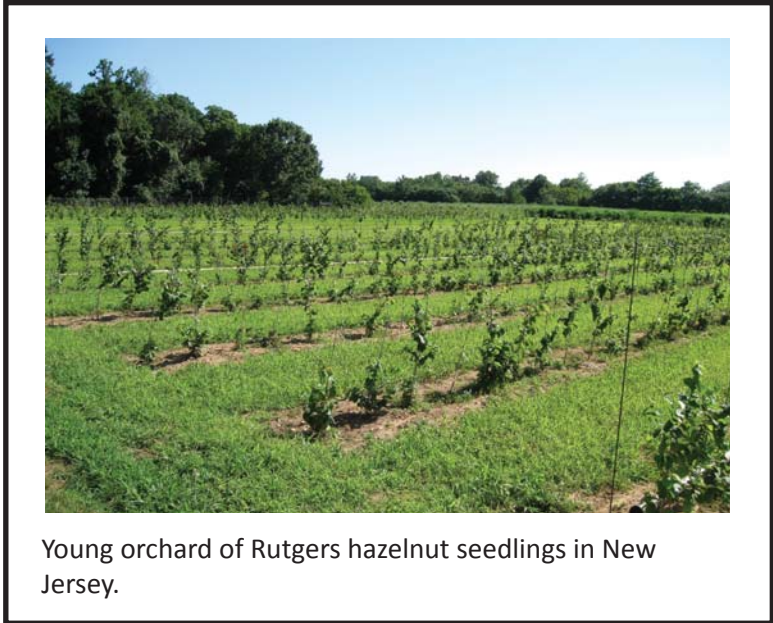
Young orchard of Rutgers hazelnut seedlings in New Jersey.

One of the things that makes growing hazelnuts so economically appealing is the minimum amount of inputs required to grow them. They have been shown to need little to no irrigation after establishment, and aside from EFB, there are few diseases or pests requiring chemical control. Of course, this could change as the hazelnut industry is scaled up in the United States, and research is currently being done to combat future potential pest outbreaks. However, in Oregon, pest and disease control is minimal compared to most other horticultural crops. Ideally, they should be grown on well-drained soils with high organic matter, similar to many other tree fruit crops. Hazelnuts are easier to maintain than other tree crops in respect to their pruning requirements.