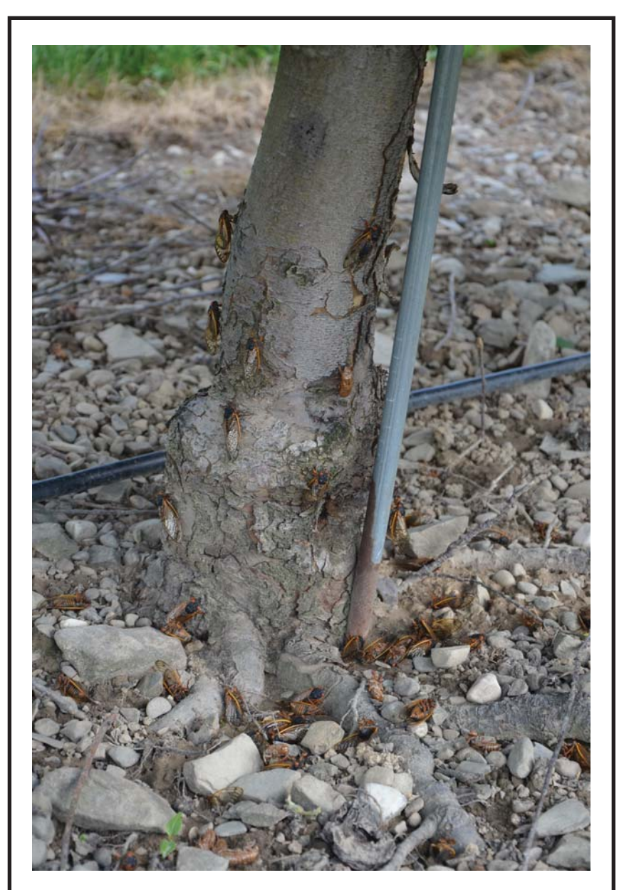
Figure 1. The 17-year cicada in a moribund state.

Tree fruit producers with highpressure cicada blocks made at least one application of an insecticide to reduce egg-laying damage to branches during the first week in June. Yet growers have had a difficult time discerning how effective these treatments really are. In most first- and second-cover treatments used against PC and codling moth, the cicada can still be found in trees shortly after applications. Some treatments induce a knock down effect lasting only a few hours before the insect is back on its feet, climbing up the trunk and limbs to cause trouble. This 'mostly dead' effect or moribund state, has been observed