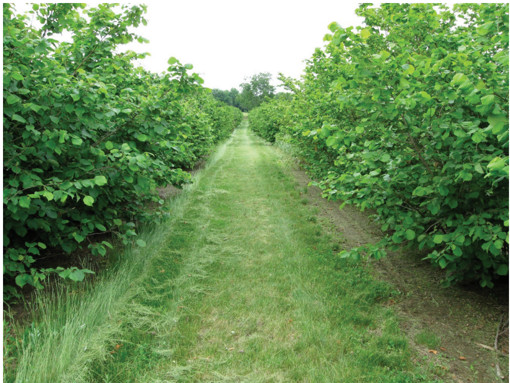
Figure 1. A hazelnut seedling block in the breeding program at Rutgers University.

The limitation for eastern growers of hazelnuts is