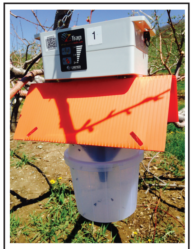
Figure 5. 'Z-Trap' (Spensa Technologies, spensatech.com) automated pheromone traps deployed at UMass Cold Spring to monitor Oriental fruit moth, codling moth, and oblique-banded leafoller. Z-traps were used with Spensa's MyTraps to automatically monitor adult flight of these moths and set biofix.

Spotted Wing Drosophila (SWD) got off to a slow start in 2014, but the numbers ramped up significantly in early September. Again, a statewide trapping and monitoring program was in-place by UMass Extension and partially funded by the Massachusetts Department of Agricultural Resources. Aggressive management of SWD where present using insecticides was commonplace. A dedicated SWD web page was maintained on the UMass Fruit Advisor.