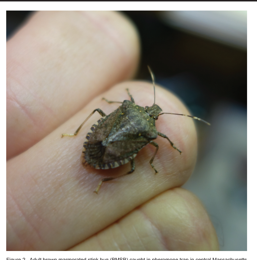
Figure 2. Adult brown marmorated stink bug (BMSB) caught in pheromone trap in central Massachusetts orchard in early September, 2014.

The Massachusetts NEWA network (<u>http://newa.</u> <u>cornell.edu</u>) includes 21 on-site weather station/ orchards (plus 23 airports, total 44 locations) providing fruit and vegetable growers with daily developmental models (including forecasts) to aid in decision-making for management of insect and disease pests. Some of these locations were a centerpiece for providing Extension team-based IPM recommendations on diversified fruit & vegetable farms via the Extension IPM (eIPM) Project, which also provided training in monitoring and management of key pests to nine