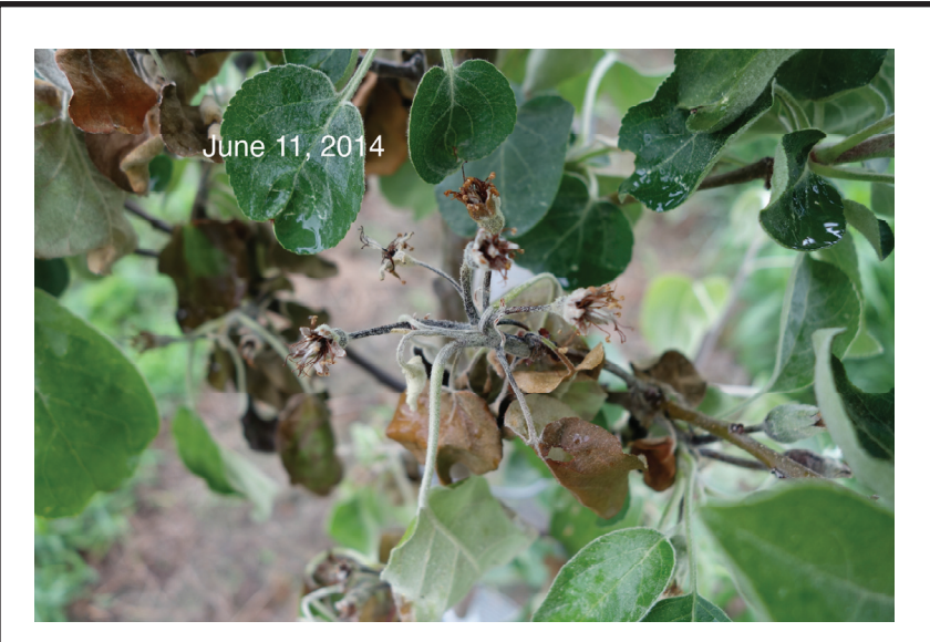
Figure 1. Fire blight symptoms in apple observed and the severity of infections realized in very early June, 2014 in Massachusetts.

Apple harvest started about right on schedule. Most growers felt production was going to be overall down. McIntosh and Cortland in particular were on the lighter side. Most likely the trees were taking a year "off" after the heavy crop in 2013. But the crop