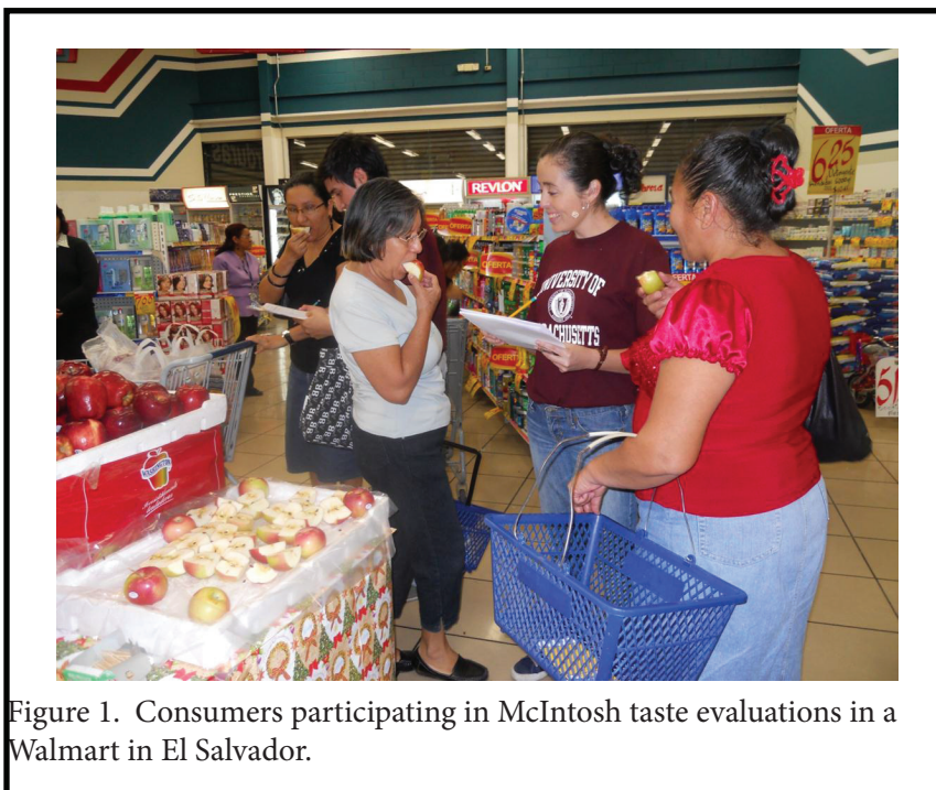
Figure 1. Consumers participating in McIntosh taste evaluations in a Walmart in El Salvador.

In relation to the size that consumers like to buy, 4% preferred small sized (175 to 216 apples per