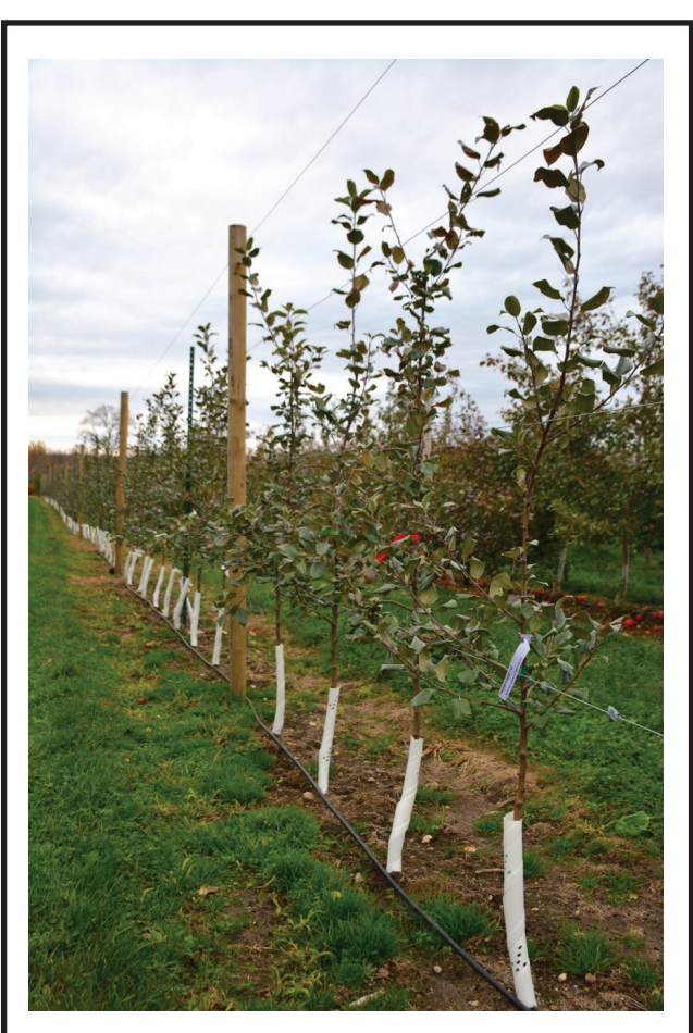
The 2014 NC-140 Vineland/Geneva Apple Rootstock Planting, UMass Cold Spring Orchard, October, 29, 2014.

Geneva rootstocks are better known and more widely available, although supply has been constrained to date. For more information on the commercially available Cornell-Geneva rootstocks, see: <a href="http://www.cctec.cornell.edu/plants/GENEVA-Apple-Rootstocks-Comparison-Chart-120911.pdf">http://www.cctec.cornell.edu/plants/GENEVA-Apple-Rootstocks-Comparison-Chart-120911.pdf</a>.