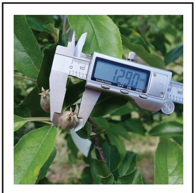
Figure 3. Me asuring fruit diameter with electronic calipers.

At the UMass Cold Spring Orchard, a petal fall application of NAA plus carbaryl was made. After the second measurement, based on the predicted number of