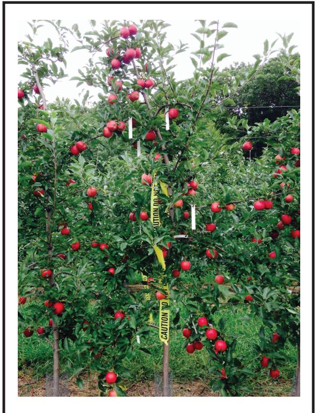
Figure 4. A precision thinned tree at harvest time.