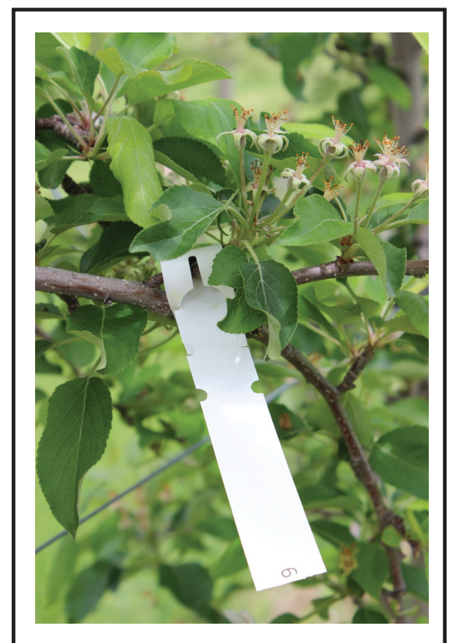
Figure 2. A fruiting spur tagged at petal fall.