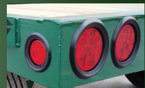
Optional LED Light Packages

Covered by Diller's Exclusive 3 Year Warranty See Warranty Guide for Coverage Details