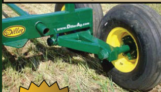
Optional Walking Beam Axles