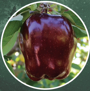
Chelan Spur™ Very compact, high color red delicious sport. USPPAF