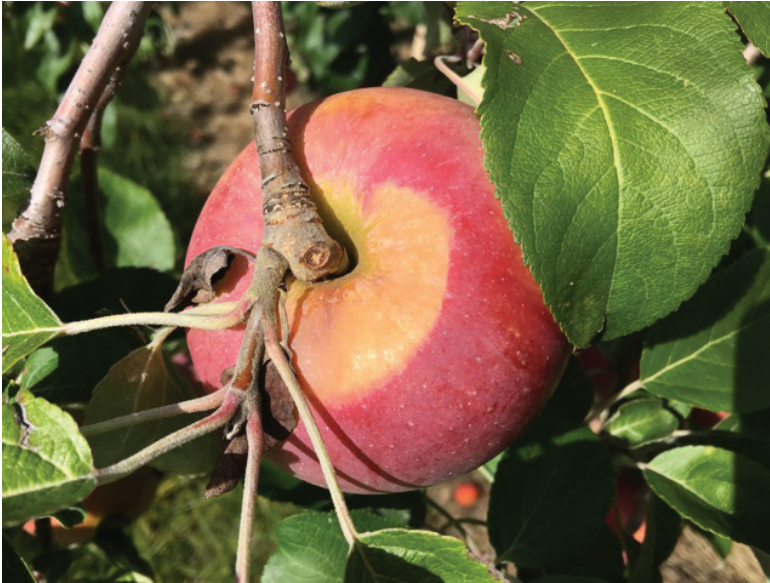
Severe sunburn on Snowsweet can have a paper-like appearance.

Tower sprayer using air induction nozzles, the sprayer was calibrated at 100 GPA. The Raynox treatment rate was 2.5 gallons per acre. Treatments were evaluated on 9 September for Incidence of sunburn as a % of fruit injured. Rows were planted north-south.