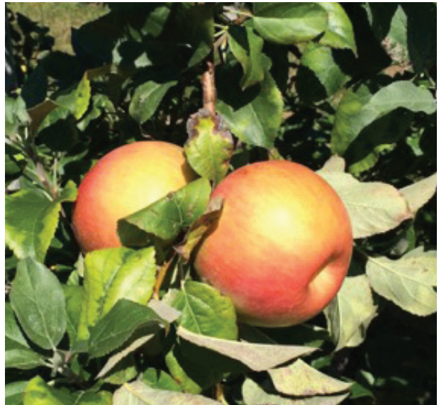
Sunburn on untreated Honeycrisp fruit in 2015, Rutgers Snyder Farm, New Jersey.