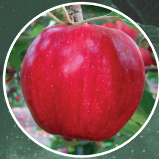
Brookfield Gala® High color Gala sport with exceptional shape. USPP#10,016