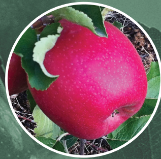
Lady in Red High color sport of Cripps Pink. USPP#18,787