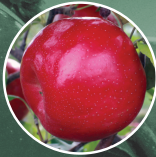
Royal Red Honeycrisp® High color sport of Honeycrisp. USPP#22,244