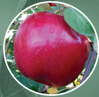
Aztec Fuji® DT12 Variety High color sport of Fuji. Aztec® Fuji is a protected trademark of Waimoa Variety Management Ltd.