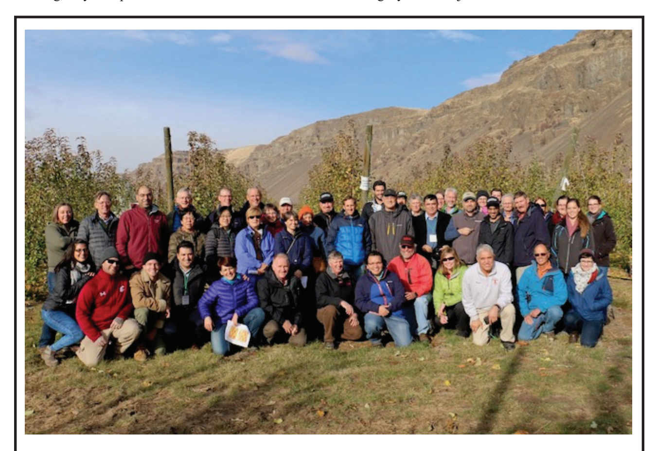
NC-140 Technical Committee members at WSU Sunrise Orchard, November 15, 2017.

plantings at UMass: one peach rootstock planting and two apple rootstock plantings at the UMass Orchard in Belchertown, and an organic apple rootstock planting at Small Ones Farm in Amherst. Their report to NC-140 is available on the NC-140 website, http://nc140. org under "State Reports." The NC-140 group also visited Washington State University's Sunrise Research Orchard south of Wenatchee, and McDougal & Sons, Inc. Legacy Orchard just outside of Wenatchee.