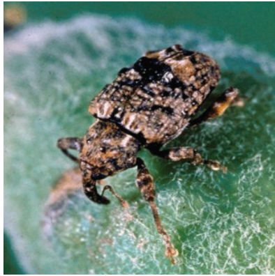
Figure 1. Plum curculio adult.

generation exists it could impact management programs and increases the risk of fruit with live worms at harvest. In recent years, growers have ap-