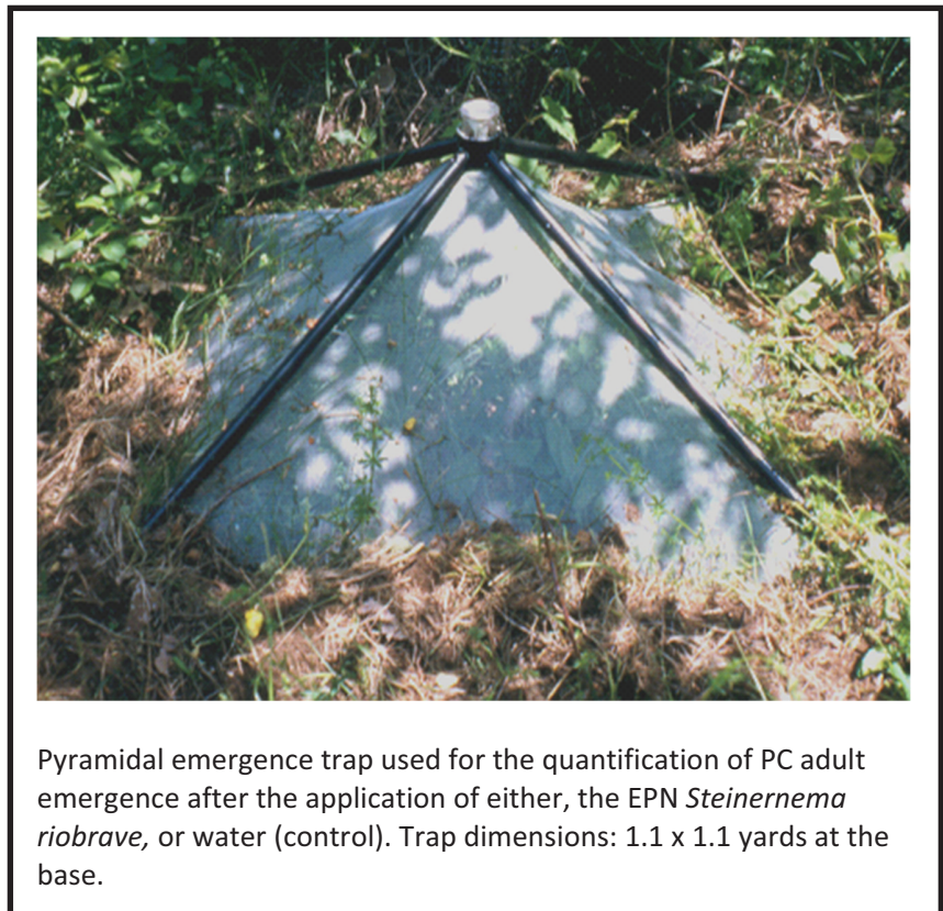
Pyramidal emergence trap used for the quantification of PC adult emergence after the application of either, the EPN Steinernema riobrave , or water (control). Trap dimensions: 1.1 x 1.1 yards at the base.

sachusetts, and 100% control in West Virginia on both years. Another nematode species, Steinernema feltiae , caused 0% and 84.6% control in 2011 and 2012, respectively, in Belchertown, and 78.2% and 69.7% control in West Virginia. These results are highly encouraging because this is the first time that biological control of