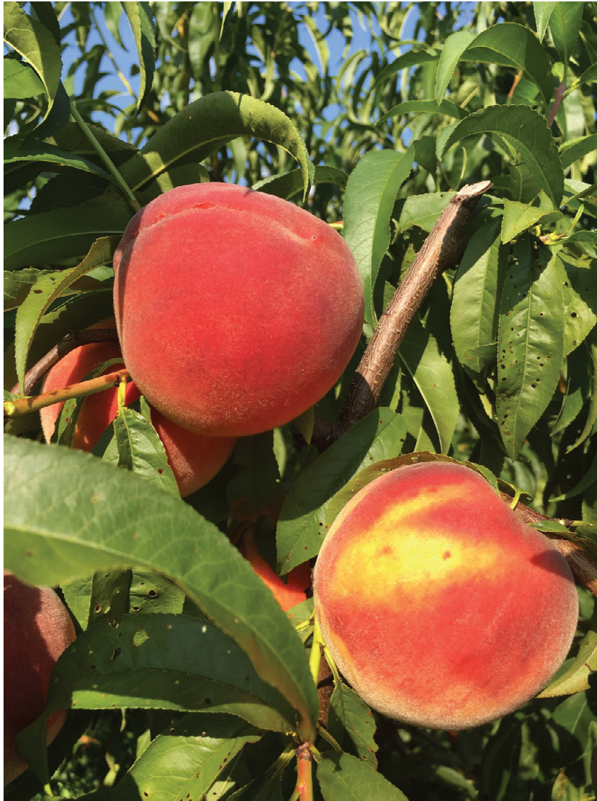
Figure 1. Fruit of Selena peach from the Stone Fruit Breeding Program of Rutgers/NJAES.