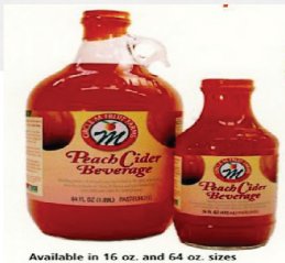
Available in 16 oz. and 64 oz. sizes

Made from fresh New Jersey Peaches "Peach Cider Drink, Peach Salsa, Peach Preserves"