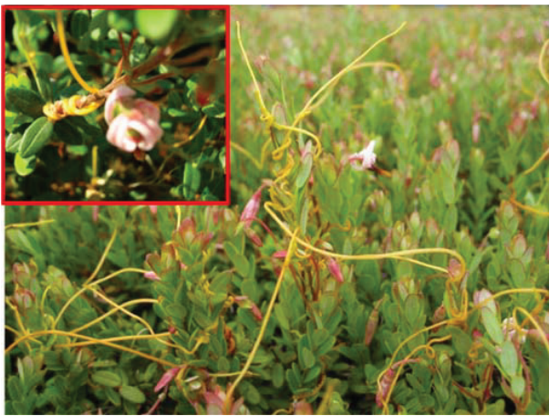
Figure 9. Cuscuta spp. commonly known as dodder shown on cranberry. Inset shows close up of dodder tendrils wrapping around a cranberry stem.

5% of the responders chose “the actual devil”, an answer that should be considered technically correct given the noxious nature of this invasive weed. 25% responded with “I don’t know”. Solanum carolinense (Figure 8, horsenettle) was correctly identified by 34 % of participants while another 30% identified it as night