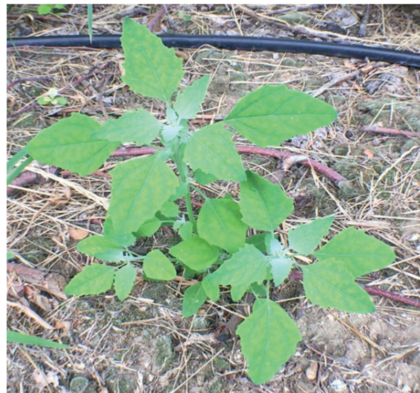
Figure 2. Chenopodium album , commonly known as lamb's quarters.

their roots. Black walnut, for example can kill apple trees if the two root systems are in close proximity to one another.