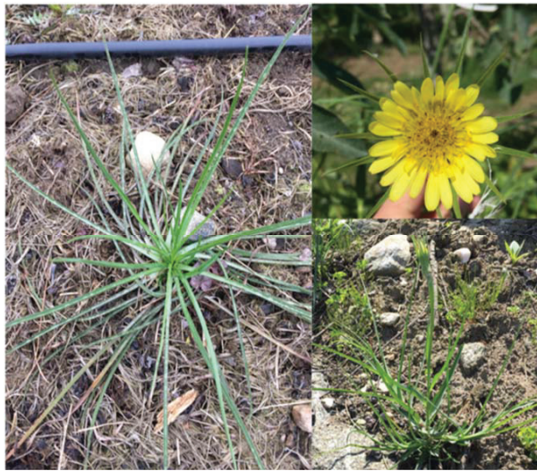
Figure 3. Tragopogon dubius , commonly known as yellow salsify.