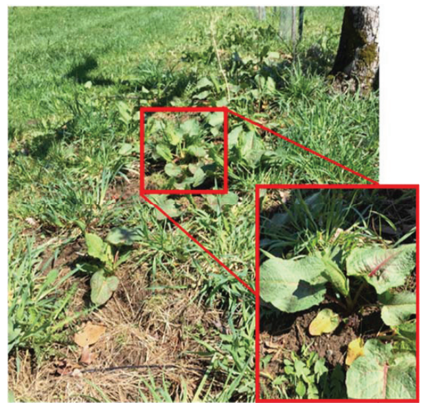
Figure 4. Rumex obtusifolius , commonly known as broadleaf dock.

The damage weeds cause is almost as diverse as weed species populations. This makes proper identification of weeds present in crops all the more important. In order to determine how best to implement weed management Extension educational programming, a survey “pop quiz” was given to a group of growers who attended the 2019 New England Vegetable and Fruit Conference (NEVFC) in Manchester, NH. The purpose of this survey was to determine the level of grower’s knowledge on weed species identification.