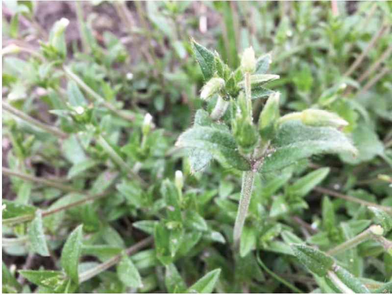
Figure 6. Cerastium vulgatum , commonly known as mouse-eared chickweed.

primary crop is: small fruit; tree fruit; vegetables or ornamentals, and to identify eight commonly occurring weeds.