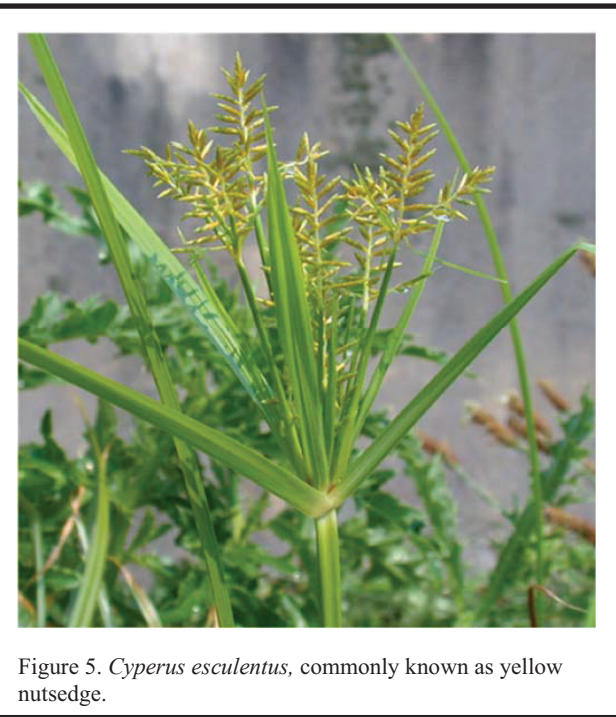
Figure 5. Cyperus esculentus , commonly known as yellow nutsedge.