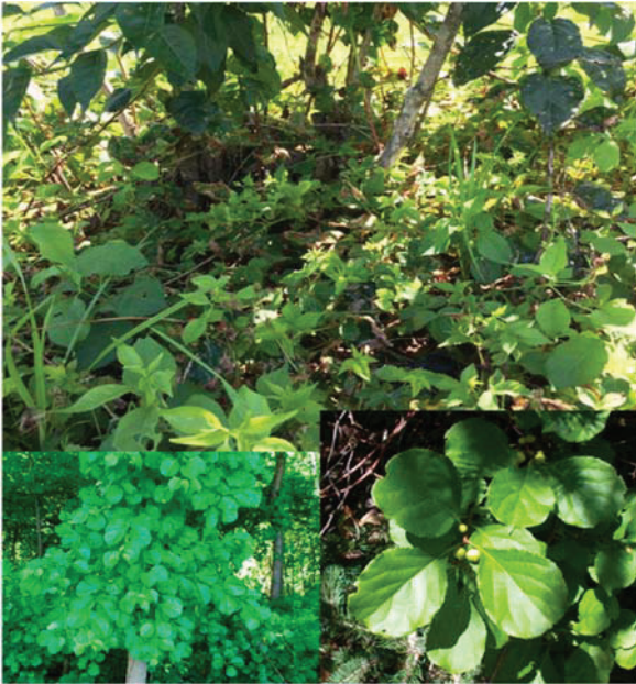
Figure 7. Celastrus orbiculatus , commonly known as oriental bittersweet.

The majority of participants, 61%, identified vegetables as their primary crop. The remainder of the