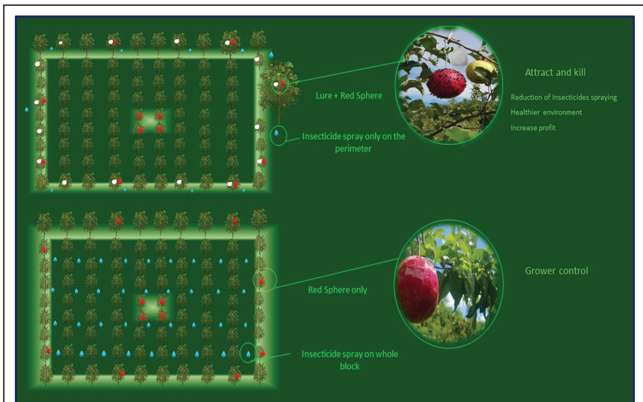
Figure 1. Schematic illustration of the 2020 evaluation of an attract-and-kill (AK) strategy for apple maggot fly control involving (1) use of synthetic lures deployed on perimeter-row trees in AK blocks and (2) sugar (3%) added to the insecticide sprays that were confined to perimeter-row trees only. The efficiency of this management was compared against grower control blocks. The red circles are indicative of the location of red sticky spheres in both types of blocks and the white circles represent lures deployed in AK blocks only.

At harvest, for each block we visually inspected 20 fruits from 16 trees located left and right of a monitoring sphere, and from 8 trees located in the block interior, for a total of 480 fruits per block. Across all 11 orchards and