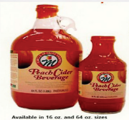
Available in 16 oz. and 64 oz. sizes

Made from fresh New Jersey Peaches "Peach Cider Drink, Peach Salsa, Peach Preserves"