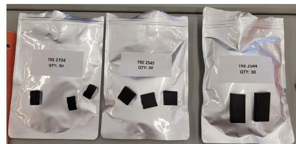
Figure 1. Experimental benzaldehyde lures formulated by Trécé, Inc., in a black polyvinyl chloride (PVC) proprietary matrix.

Traps were hung on the upper third of the tree canopies and were 15 meters apart. Traps were examined beginning on 5 May and every seven days thereafter until 25 July. All lures were replaced every 6 weeks and sticky liners were replaced whenever the liner became crowded with insects. We also collected data on the