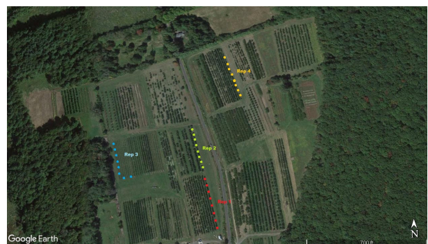
Figure 2. Trap deployment on the perimeter of a commercial apple orchard block. There were eight treatments replicated four times.