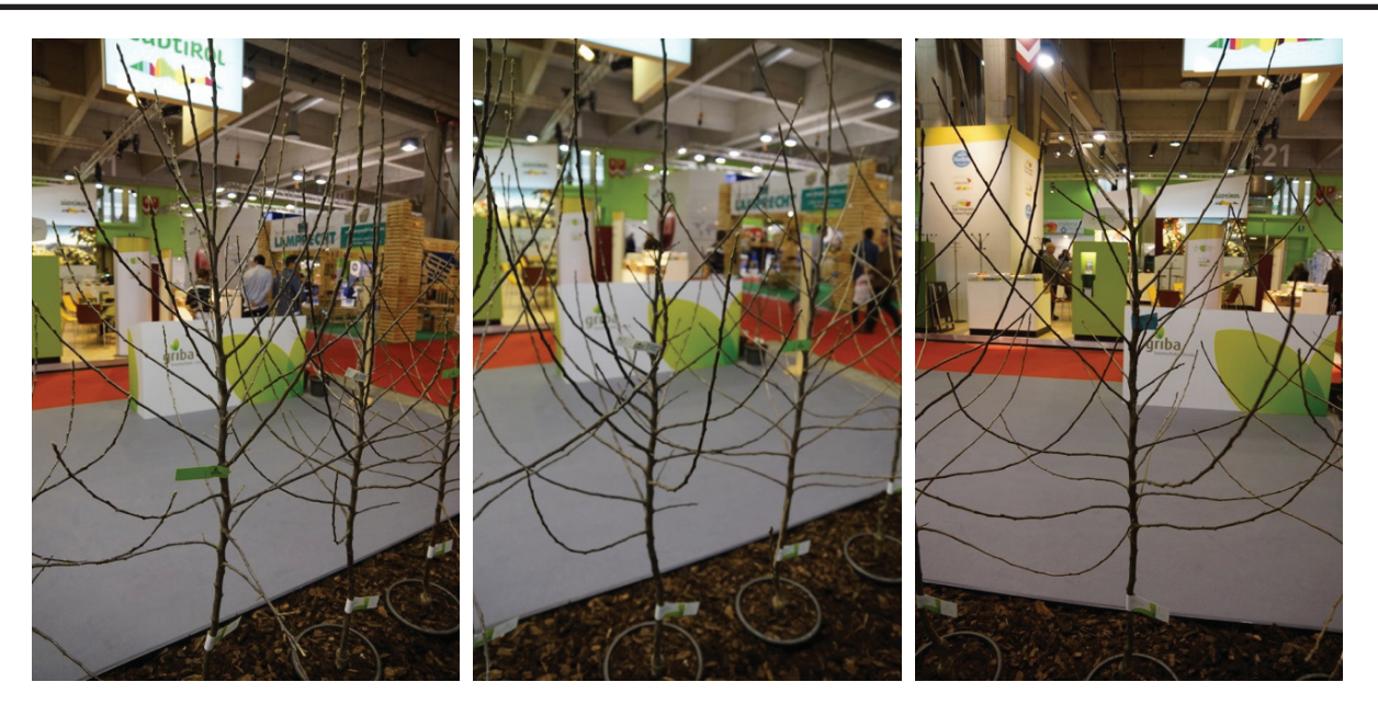
Three different cultivar tree samples of the highest quality apple nursery trees, grade 1st Quality 7+ Extra, at the GRIBA Nursery display at the INTERPOMA Trade Show in Bolzano, November 14, 2014.