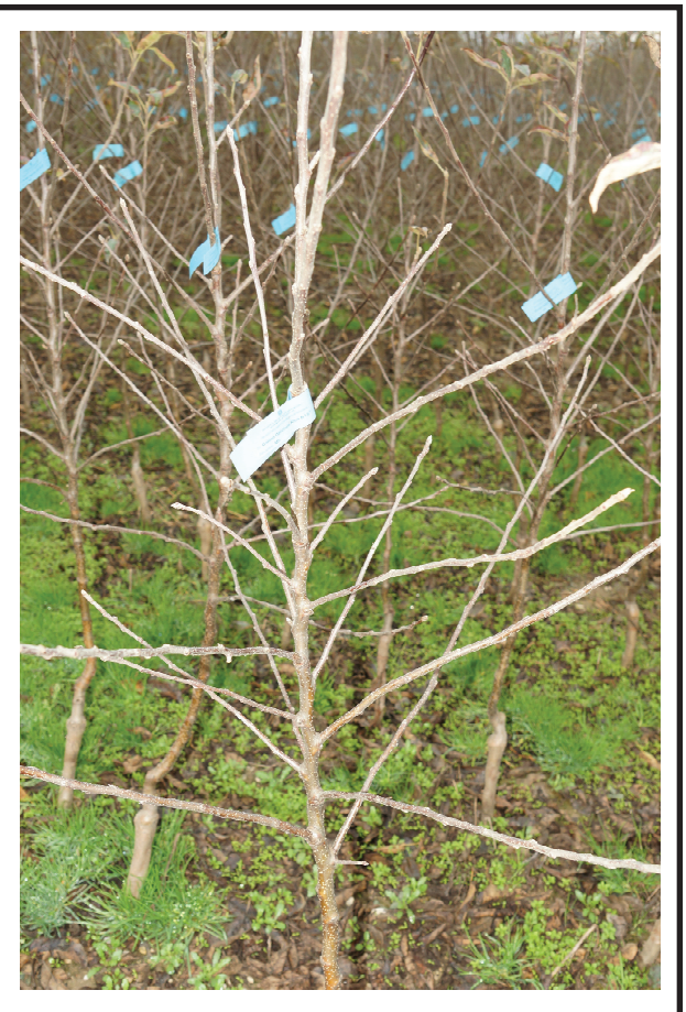
A perfect golden delicious tree/ on M.9 NAKBT337- branched at GRIBA nursery- Tues November 18. This would be graded a 7+Tree with seven feathers over 30 cm long, well spaced good angles.