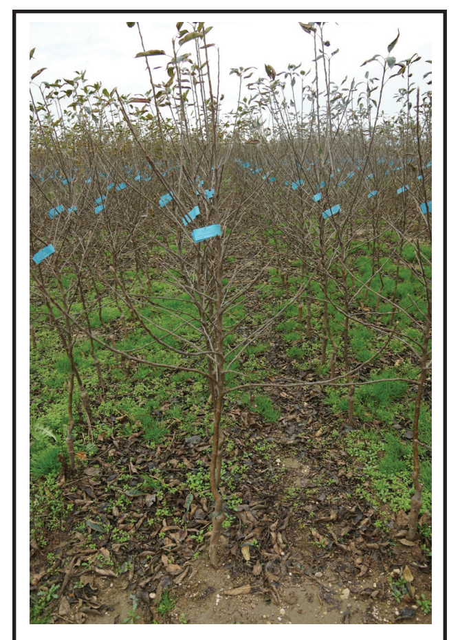
Overview Photo of Golden Delicious Nursery Stock at GRIBA Nursery, note the 15 plus feathers on these trees.