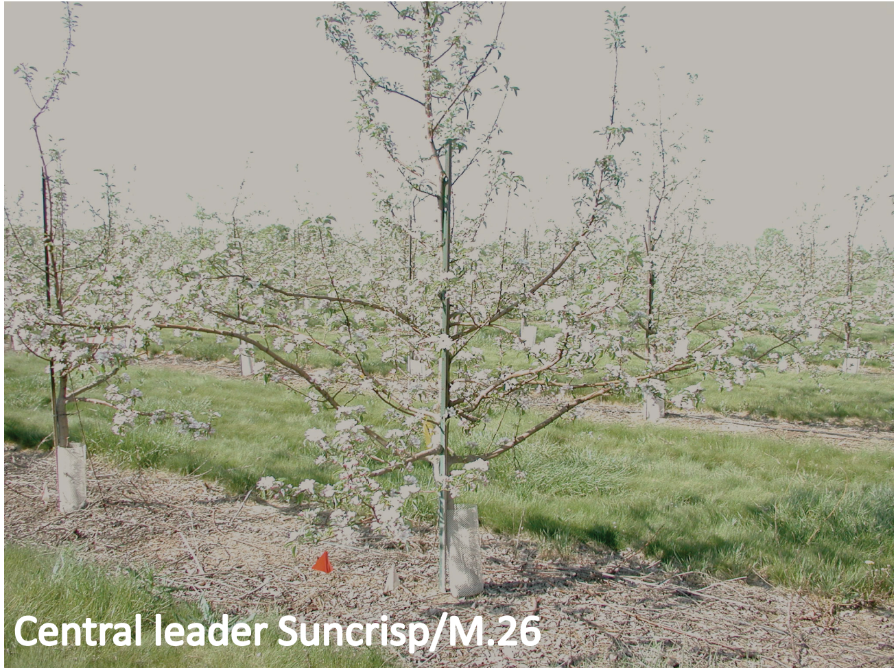
Central leader Suncrisp/M.26

growth at the site of the cut and the three to four buds below it. On a non-bearing tree, this type of stimuli causes the tree to remain in the vegetative mode, which delays cropping. For this reason, pruning young non-bearing trees should be minimized to correct major structural defects. Tree training and minimal corrective pruning of tree structure in the early non-bearing years will enhance the development of a new orchard ensuring the trees fill their space and begin fruiting.