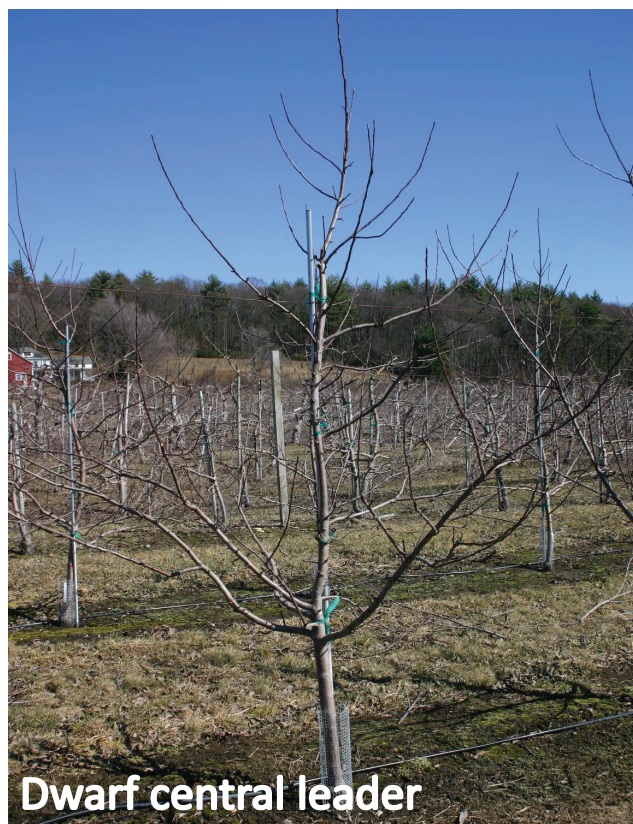
Dwarf central leader

Although proper pruning is an overall dwarfing process, it is locally invigorating, stimulating vegetative