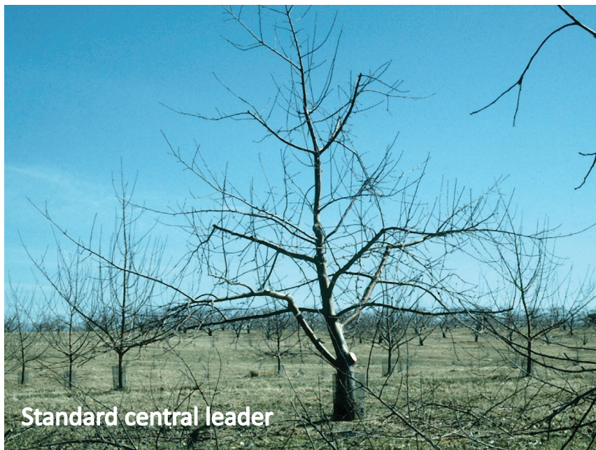
Standard central leader

wood will have a good amount of spurs and produce the best apples; and 3-year old wood will still produce fruit but is ready to make way for new fruiting wood using a thinning/renewal cut. In the ideal, you would have a nice balance of 1/3 each of 1-, 2-, and 3-year old wood. This applies to most all orchard pruning and training systems, although older, central-leader orchards will have to keep older structural wood (in addition to the central-leader) in lateral branches (scaffold limbs) to grow younger wood from and support the crop load.