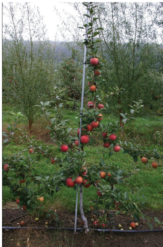
Young central-leader Cameo on M.9.

The objective of tree training and pruning is to maximize the sunlight interception of the tree. This allows for light distribution within the tree canopy to maximize fruit quality for the current season and to provide fruit bud initiation for next season's crop. Correct pruning and tree manipulation techniques must be done on an annual basis in the dormant season. On some varieties a "tune-up" in the summer assists with color formation. Growers should also keep in mind other important factors that justify the need for annual pruning: maintenance of tree height; building a structure to support crop load; and maintaining crop load by balancing vegetative growth with fruiting. Maintaining