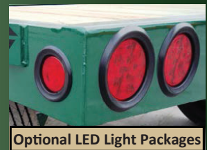
Optional LED Light Packages

Covered by Diller's Exclusive 3 Year Warranty