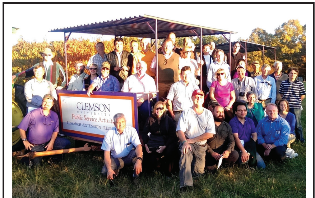
NC-140 technical committee meeting, Clemson, South Carolina, November, 2014, touring peach rootstock plantings at Clemson University.