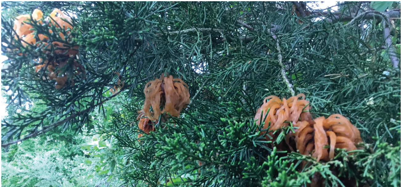
Cedar Apple rust on cedar trees (the alternate host) in Annandale, NJ. Make sure to begin applying fungicides to apple trees at the pink stage to prevent infection.