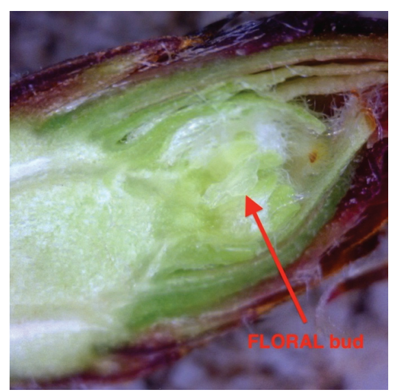
These are flower buds!