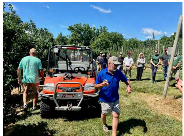
Vivid Machines (vivid-machines.com) camera mounted on the hood of the Kubota ATV.