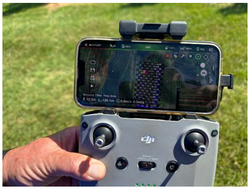
DJI drone controller with flyover map displayed on the iPhone