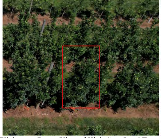
Wightmans Drone View of High Crop Load Trees