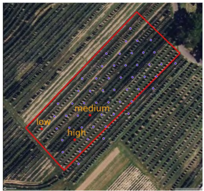
Example of High sample apple tree as seen but the Outfield drone flyover