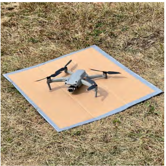
Outfield Drone- Photo Jon Clements

Outfield fruit variability map produced post-flyover