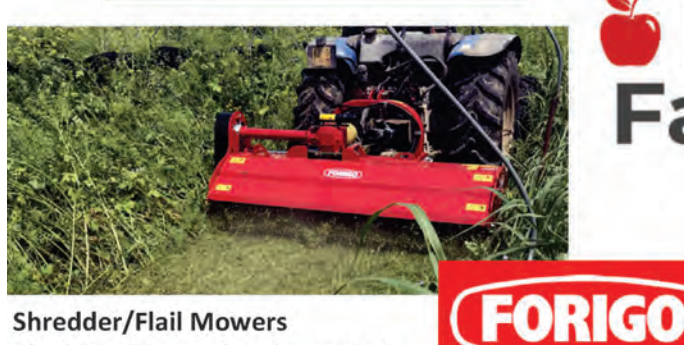
Shredder/Flail Mowers Ideal for chipping brush, managing field edges, handling cover crops

Sweeper Ideally for keeping under the trees clean for PYO.