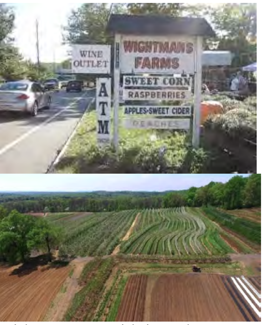
Wightman Farms aerial view